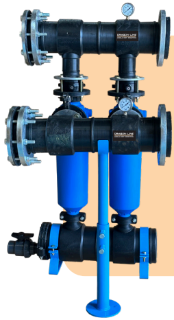
2½", 3" DOUBLE Sand Separator