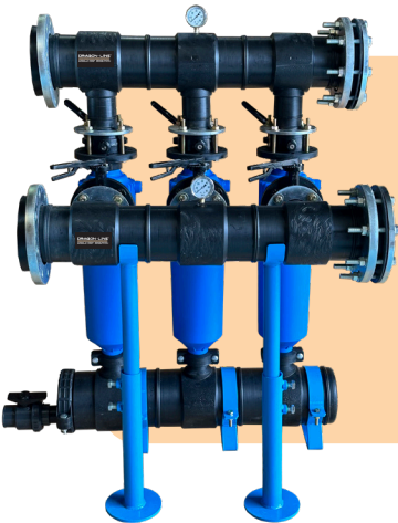
2½", 3" TRIPLE Sand Separator