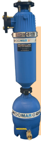
2", 2½", 3" SINGLE Sand Separator

Varieties and sizes available to suit your needs!